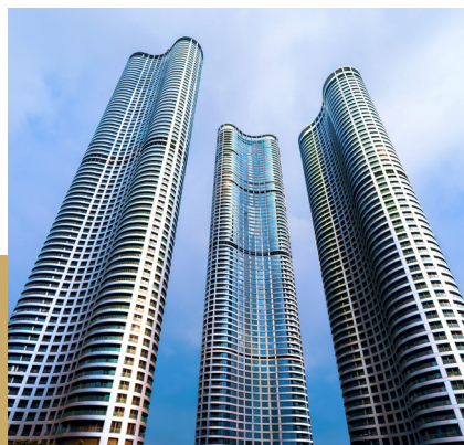
THE WORLD TOWERS

India’s finest residences on Mumbai’s Billionaires’ Row.